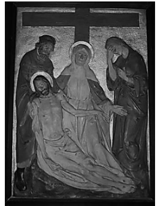
Jesus' body is taken down from the Cross. 13 th Station of the Cross St Stephen, Gloucester Road

May you see your Redeemer face to face, and enjoy the vision of God for ever. Amen.