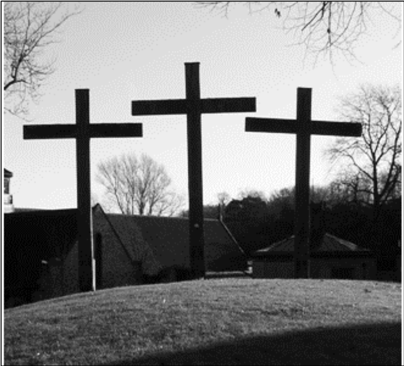
Calvary in the grounds of the Shrine of Our Lady of Walsingham

Almighty God, Father of all, have mercy on the souls of those who, in their darkness, have thrown away their mortal lives; grant them light and salvation that they may find life in your love and glorify your Holy Name, through Jesus Christ our Lord. Amen