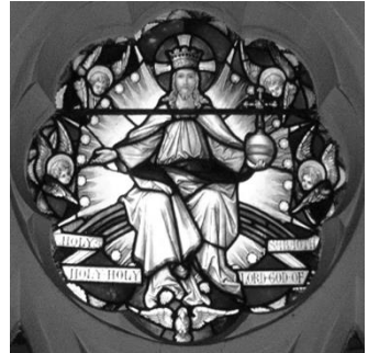
Christ in Glory: St Stephen, Gloucester Road, Kensington – of which The Guild is patron

Remove any bitterness in my heart - and fill the empty spaces with your love. Thank you, Jesus. Amen