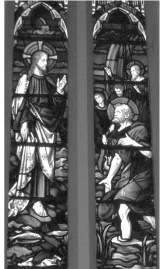
The Risen Christ: greets his disciples by the Sea of Galilee: St Stephen, Gloucester Rd