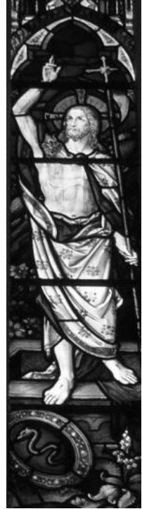
The Risen Christ: St Stephen, Gloucester Road