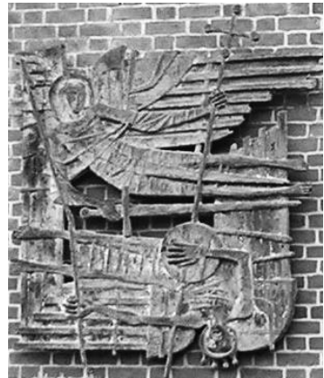
St Michael casting Satan out of Heaven. Relief on Exterior of Chantry Chapel