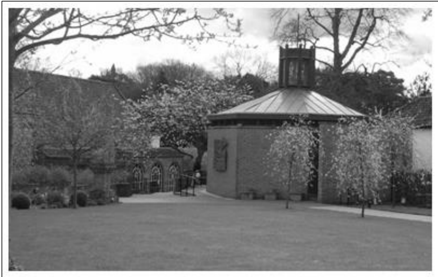
The Guild of All Souls' Chantry Chapel of St Michael at Walsingham