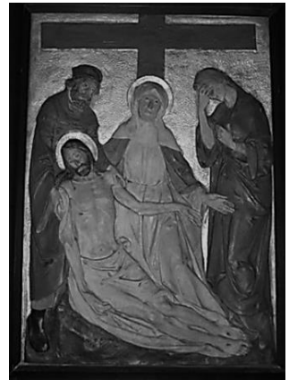
Jesus' body is taken down from the Cross. 13 th Station of the Cross St Stephen, Gloucester Road

May you see your Redeemer face to face, and enjoy the vision of God for ever. Amen.