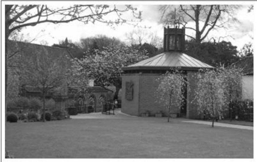
The Guild of All Souls' Chantry Chapel of St Michael at Walsingham