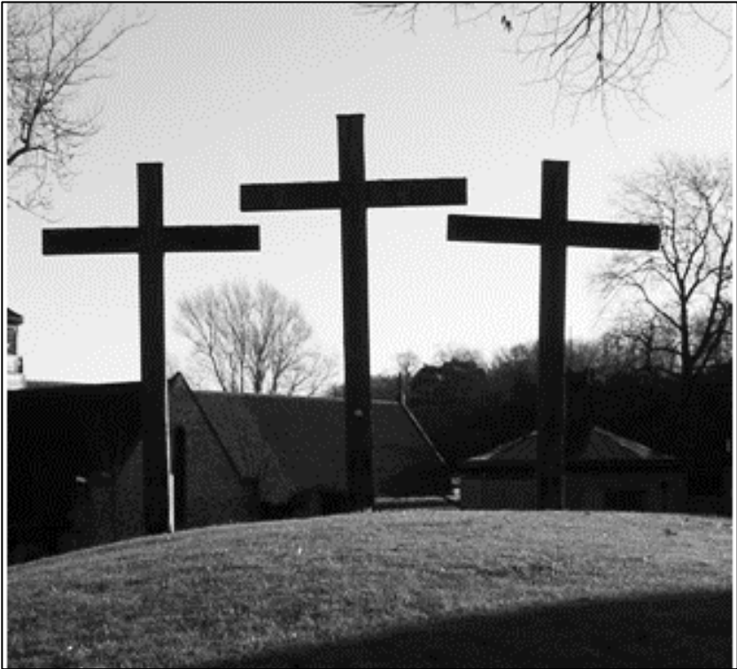
Calvary in the grounds of the Shrine of Our Lady of Walsingham

Almighty God, Father of all, have mercy on the souls of those who, in their darkness, have died by suicide; grant them light and salvation that they may find life in your love and glorify your Holy Name, through Jesus Christ our Lord. Amen