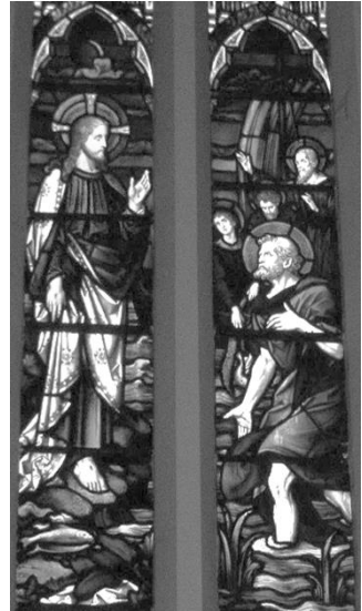
The Risen Christ: greets his disciples by the Sea of Galilee: St Stephen, Gloucester Rd