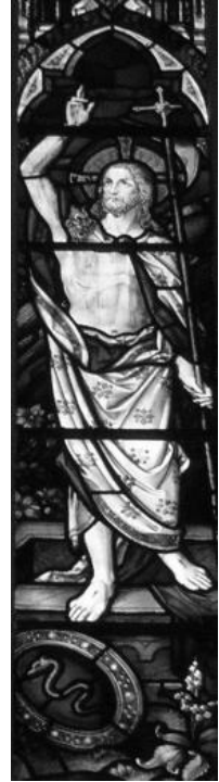
The Risen Christ: St Stephen, Gloucester Road