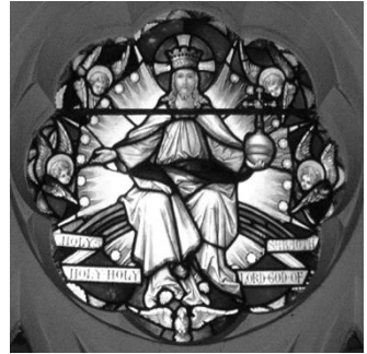
Christ in Glory: St Stephen, Gloucester Road, Kensington – of which The Guild is patron

Remove any bitterness in my heart - and fill the empty spaces with your love. Thank you, Jesus. Amen