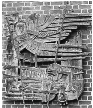
St Michael casting Satan out of Heaven. Relief on Exterior of Chantry Chapel