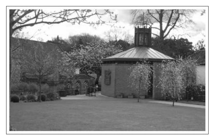
The Guild of All Souls' Chantry Chapel of St Michael at Walsingham