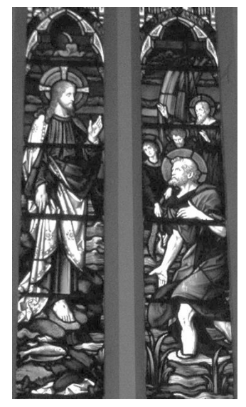
The Risen Christ: greets his disciples by the Sea of Galilee: St Stephen. Gloucester Rd