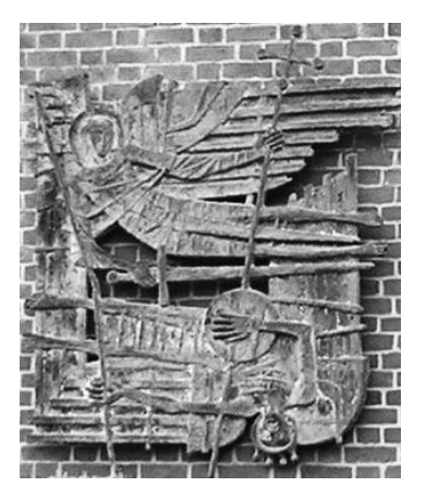
St Michael casting Satan out of Heaven. Relief on Exterior of Chantry Chapel

dead whose faith is known to God alone. May they share in eternal life with Him.